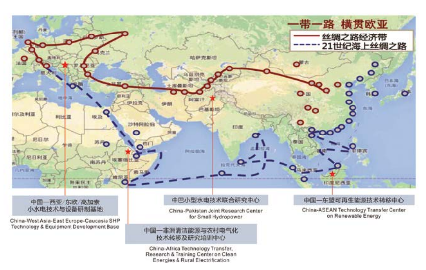
Fig. 2 Distribution of 4 Overseas Centers to be built by HRC

government officials and technical personnel in the field of water conservancy and energy from 46 African countries.